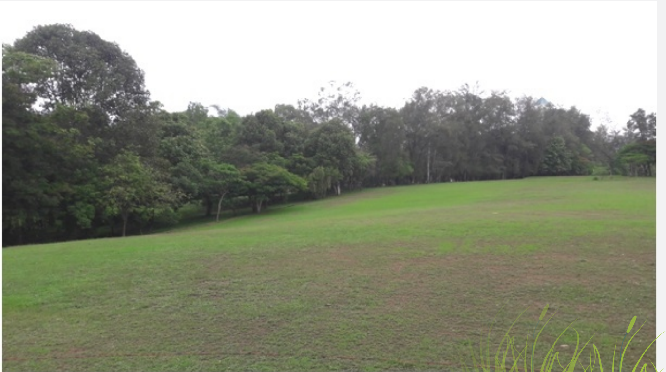
6th fairway after installation of sprinkler system