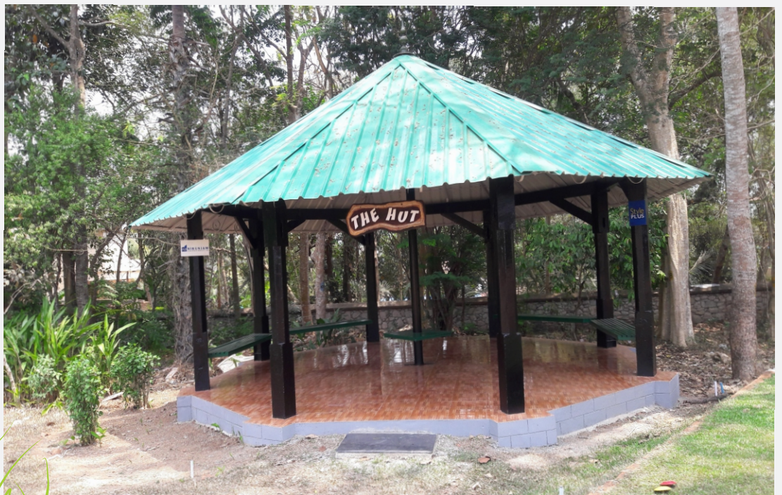
The newly renovated HUT near the 3rd Tee Box

24.5. We also place on record our gratitude to all the print and visual Media for their co-operation.