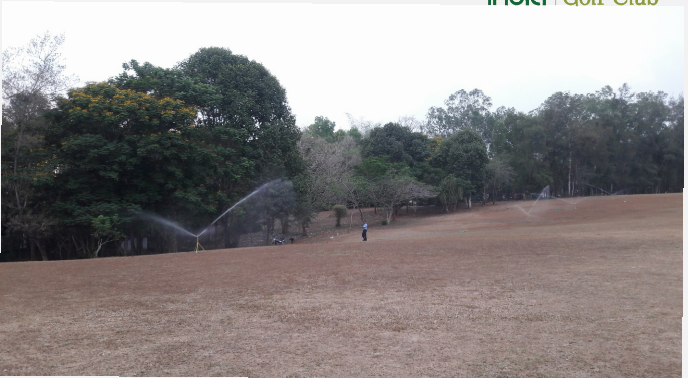
Temporary sprinkler system functioning on the 6th fairway during summer